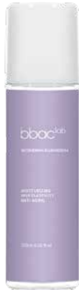
BBAC LAB RECOVERING FLUID SERUM 200ml