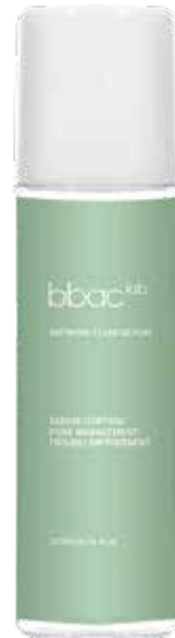
BBAC LAB REFINING FLUID SERUM 200ml

Natural Ingredient Hyaluronic Acid Biosaccharide Gum-1 Hydrolyzed Collagen Centella Asiatica Extract