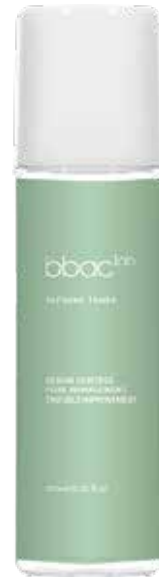
BBAC LAB REFINING TONER 200ml